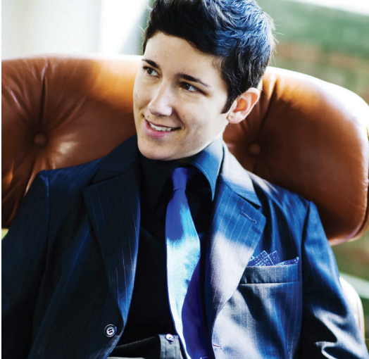
"Our Labor of Love"